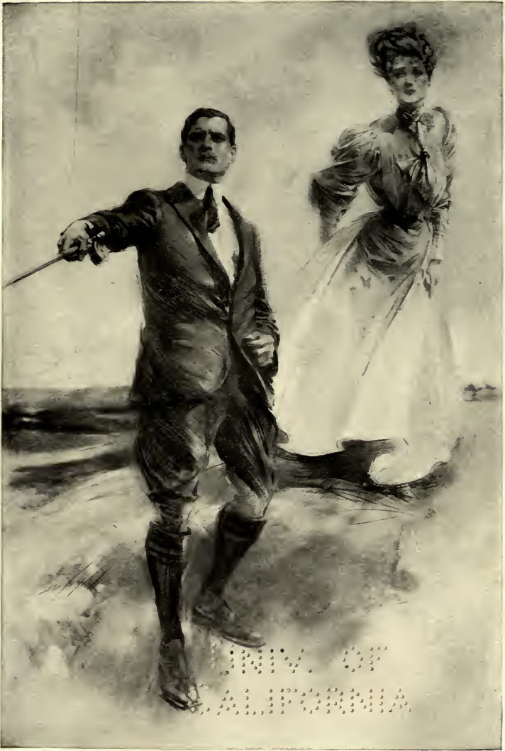
“Eileen watched the performance with growing interest.”